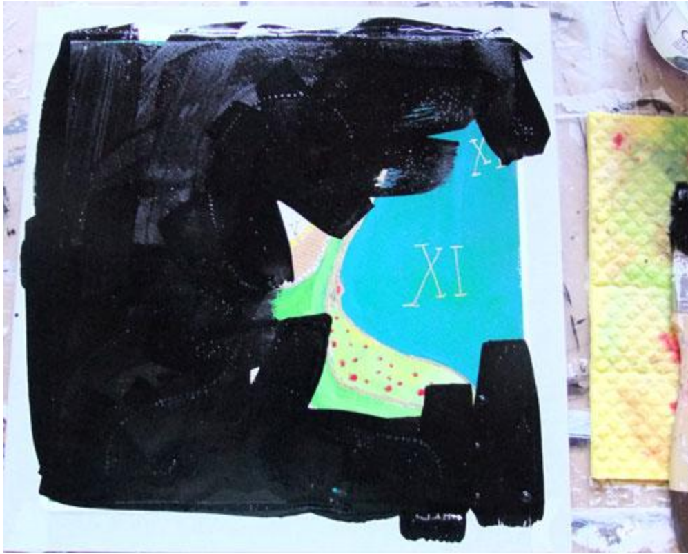
GOING.... Too late to turn back now....LOL